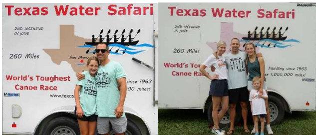
1 st -Safari in 2021 and 3 rd -Safari in 2025

How and why and how old were you when you got started in paddling?