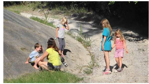
TX River Marathon, 2014