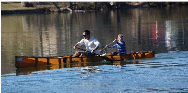
1 st Town Lake Race, 2015