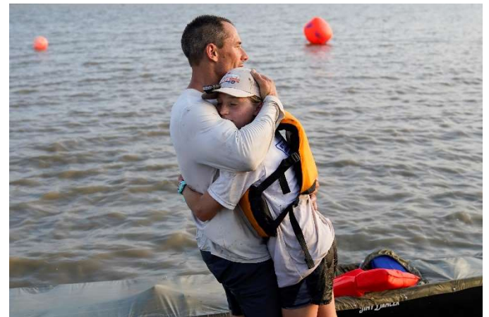
1 st Adult/Child, 1 st Mixed, 2021 Texas Water Safari