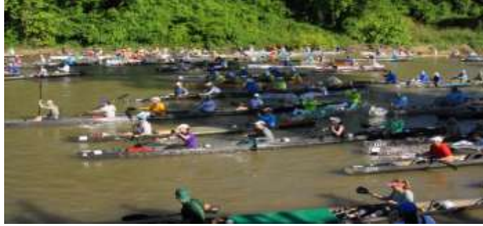
River Haven RV Park to The Pumpphouse Restaurant, Victoria City Park May 1st, 2021

Starting at the River Haven RV Resort and ending at the Pump House Restaurant, this great race is run over 35 miles of the fastest water on the Texas Water Safari course. Finishing positions in the Texas River Marathon, also fondly known as "The Prelim", are used to determine starting positions in the Safari itself, (with one position on each row being set aside for out-of-state teams whose members cannot all make it to Texas in early May.) In addition to qualifying teams for superior starting positions, this event provides racers with the opportunity to see a couple of the only real rapids on the racecourse. Many Texas Water Safari racers will traverse the "Nursery rapids" during the night and it can be very helpful to have seen them during the daylight first during the Texas River Marathon.