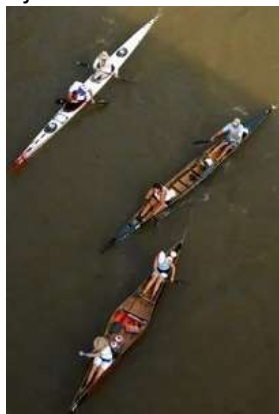
CR 100 2007